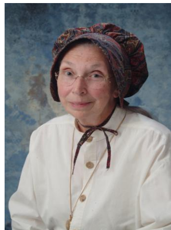
Granny G tells meaningful stories of early Texas that young students love